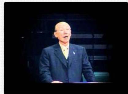
Tabernacle Prayer Video